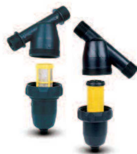
F20 / F25 / F32 / F40

Installing disc filters, the flow direction is opposite to the screen filter